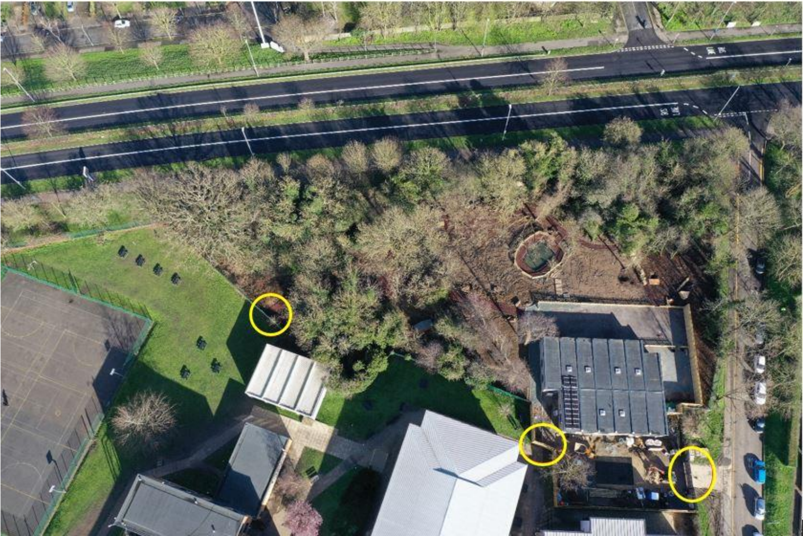
External Fire Escapes circled in picture below.